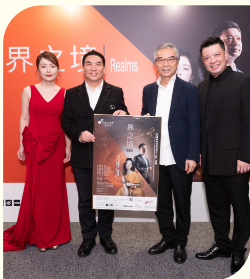
感謝 3SUPREME 全力支持