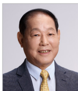
香港中樂團樂隊學院 常務副院長 Associate Director of The HKCO Orchestral Academy