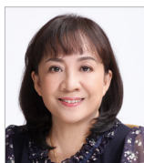
教育主任 Education Executive