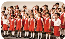
合唱：香港兒童合唱團 Chorus: The Hong Kong Children's Choir