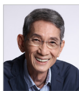
研究及發展部研究員 樂器研究改革主任 Research Fellow, Research and Development Department Research & Development Officer (Musical Instrument)